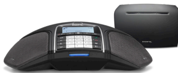
KONFTEL 300Wx IP

Teaming the Konftel 300Wx with the Konftel IP DECT 10 is one of our most popular solutions. Now it is available as a single package, delivering wireless conference calls in HD quality via your IP telephony system (SIP). Each IP DECT base can handle up to 20 registered Konftel 300Wx devices and five ongoing calls.