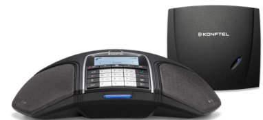
KONFTEL 300Wx ANALOG

Simple and reliable. Konftel 300Wx with Konftel DECT Base for analog connection. Simply plug the base station into the phone jack and your wireless conference solution is ready to go, with up to seven phones connected.